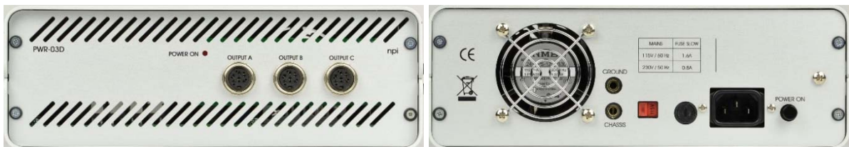
Figure 3: Left: PWR-03D front panel view. Right: PWR-03D rear panel view.

Note: The chassis of the PWR-03D is connected to protective earth, and it provides protective earth to the EPMS-E housing if connected.