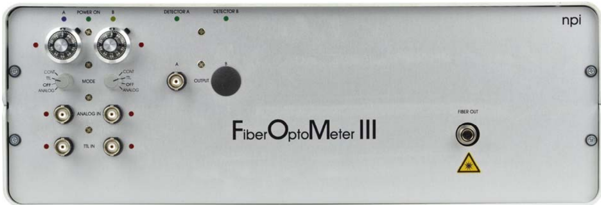
Figure 1: FOM III front panel view.