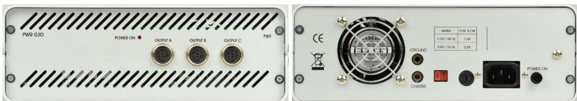
Figure 3: Left: PWR-03D front panel view Right: PWR-03D rear panel view.

Note: The chassis of the PWR-03D is connected to protective earth, and it provides protective earth to the EPMS-E housing if connected.