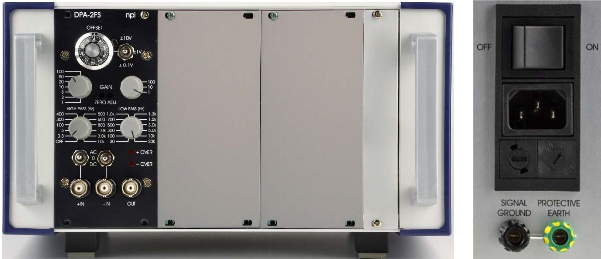
Figure 2: Left: front view of EPMS-03 housing. Right: rear panel detail of EPMS-03 and EPMS-07 housing.

In order to avoid induction of electromagnetic noise the power supply unit, the power switch and the fuse are located at the rear of the housing (see Figure 2, right).