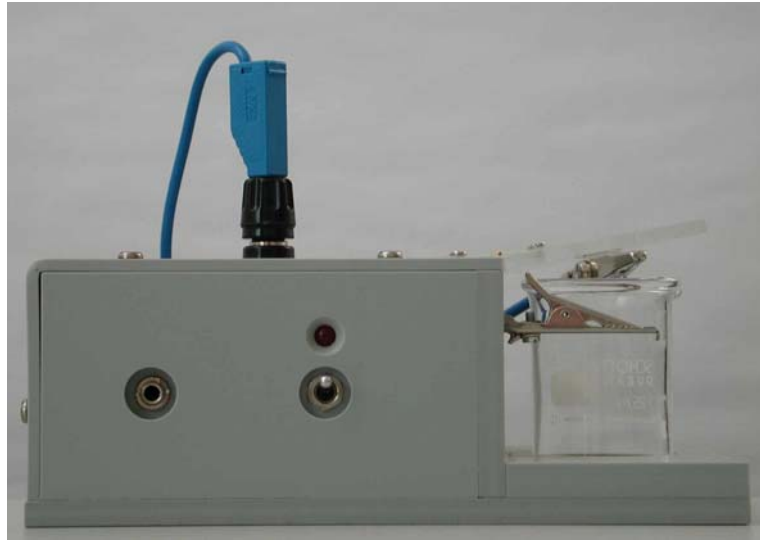
Figure 1: view of the ACI-01 apparatus

The ACI-01 apparatus is a low-cost, fully automatic system for manufacturing chlorinated silver wires, which are widely used in electrophysiology (Ag-AgCl electrodes). The quality of recorded signals relies on a thorough preparation of the Ag-AgCl electrodes.