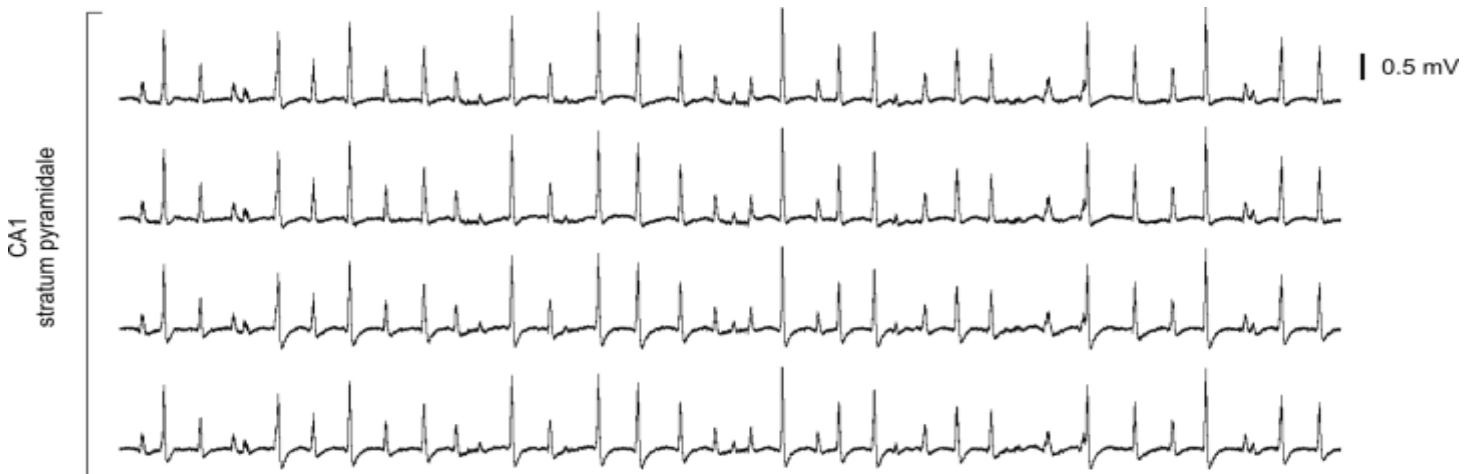
Tetrode recordings in vitro from the CA1 region (stratum pyramidale) of a hippocampal mouse slice (raw data)