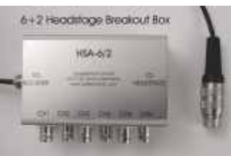
Example of Headstage and Breakout Box for 6 extracellular and 1 juxtacellular Channel