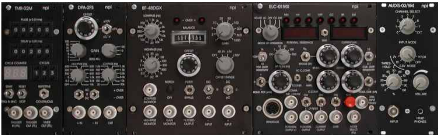
TMR-02M Timer Module

Differential Intracellular Recording and up to 16 Additional Extracellular Recording Channels for Field Potentials or Single Units