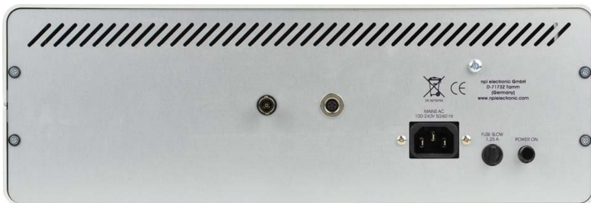
Figure 2: FOM III rear panel view.

On the rear panel of the FiberOptoMeter III housing there is the mains connection, a fuse box, and the power switch (see Figure 2).