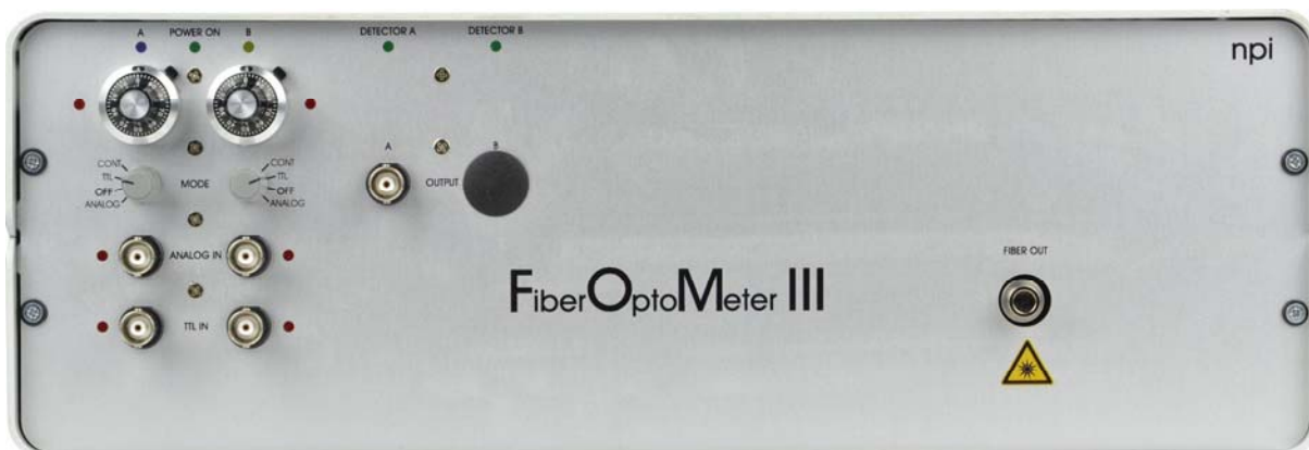
Figure 1: FOM III front panel view.