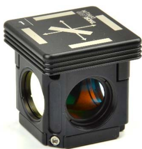
Figure 3: Filter cube insert for FOM-02D.

This FiberOptoMeter-III is equipped with special filter cubes for easy exchange of filters and dichroic mirrors (see Figure 3). The filter cubes consist of an outer frame and a removable inner cube, which is held by magnets. These cubes are self-centering and can be removed and inserted by hand - no tools are required.