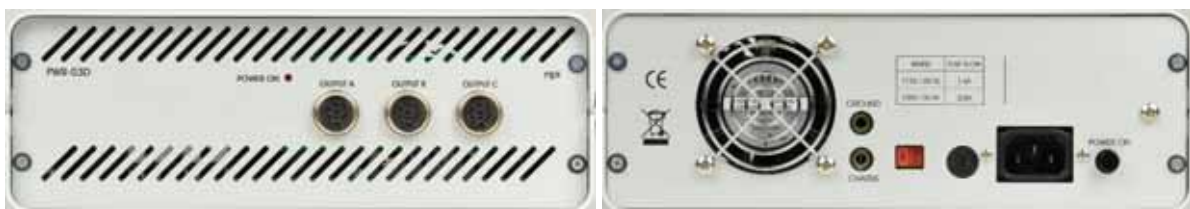
Figure 3: Left: PWR-03D front panel view Right: PWR-03D rear panel view.

Note: The chassis of the PWR-03D is connected to protective earth, and it provides protective earth to the EPMS-E housing if connected.