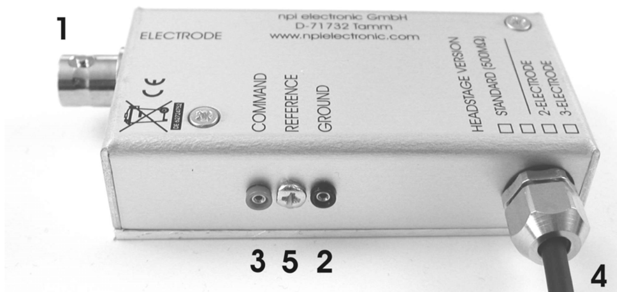
Figure 6: Headstage of the VA-10M

A 3-electrode headstage with differential input (see also Optional accessories in chapter 4) is also available. For details contact npj.