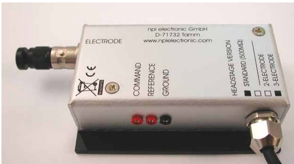
Figure 7: VA-10 3 electrode headstage with CFE electrode holder (optional)

Important: If REF is not used, REF must be connected to GROUND.