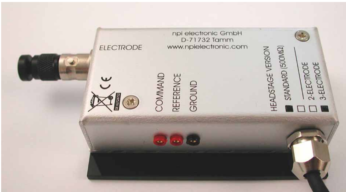
Figure 3: VA-10X 3 electrode headstage with CFE electrode holder (optional)

Important: If REF is not used, REF must be connected to GROUND.