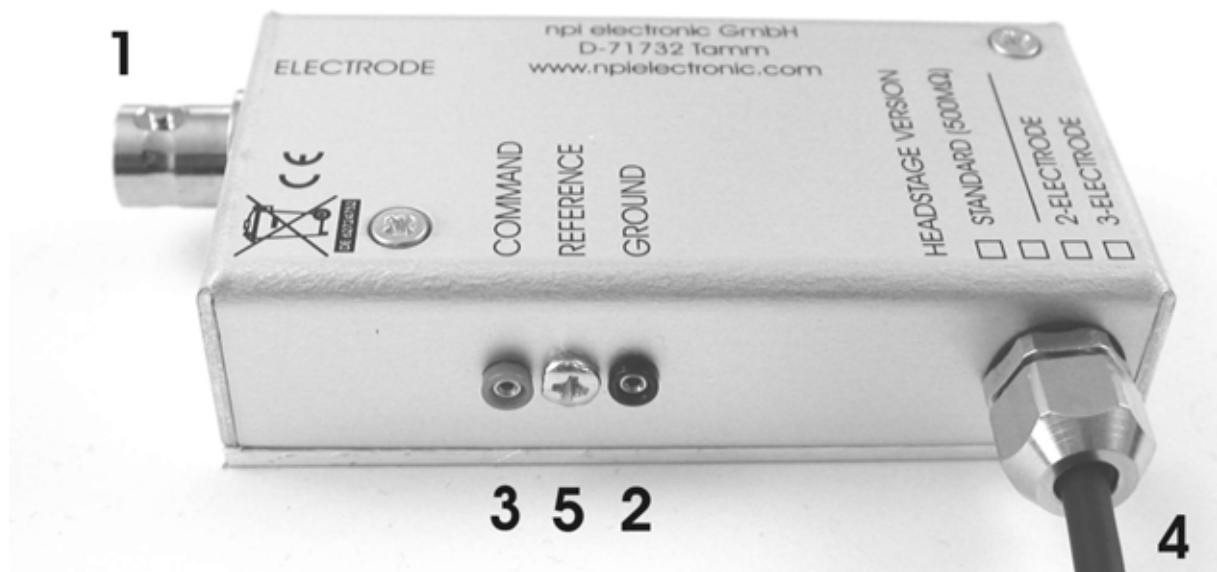
Figure 2: Headstage of the VA-10X

A 3-electrode headstage with differential input (see also Optional accessories in chapter 3, and chapter 9) is also available. For details contact npj.